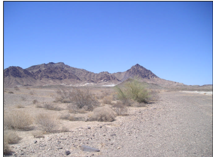
Photograph 4: View from Black Jack candidate location, facing north.