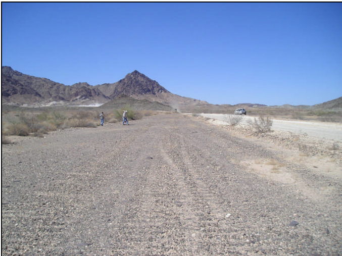
Photograph 3: View toward Black Jack candidate location, facing north.