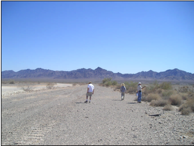
Photograph 1: View toward Black Jack candidate location, facing south.