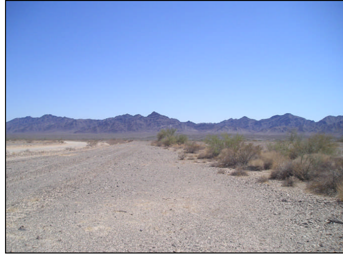
Photograph 6: View from Black Jack candidate location, facing south.