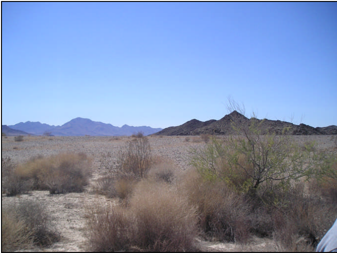
Photograph 7: View from Black Jack candidate location, facing west.