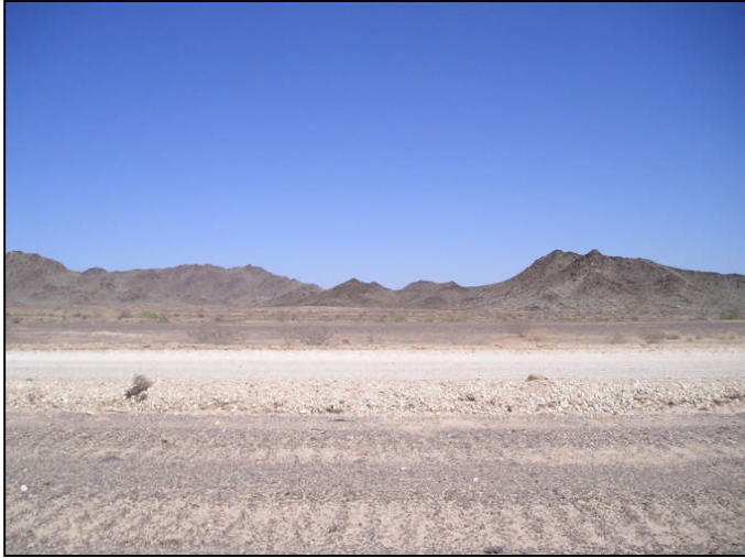
Photograph 5: View from Black Jack candidate location, facing east.