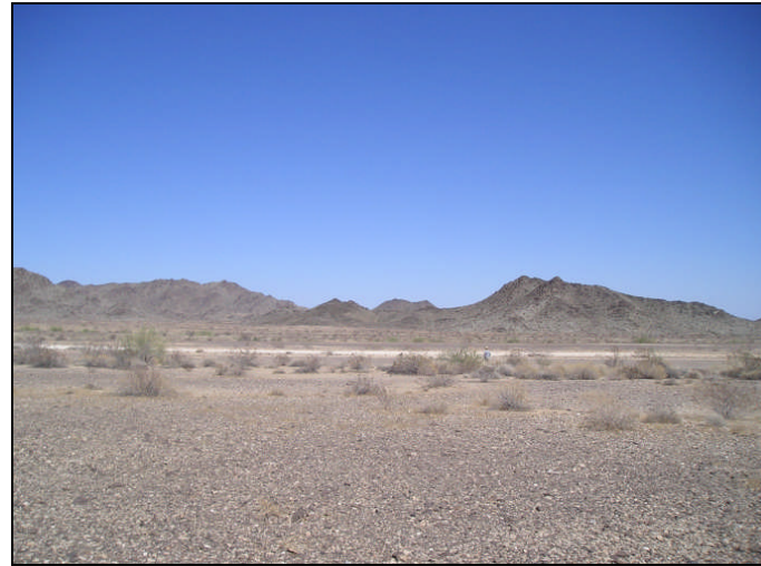
Photograph 2: View toward Black Jack candidate location, facing east.